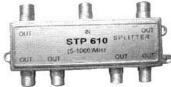
6-Way Splitter Model:STP610