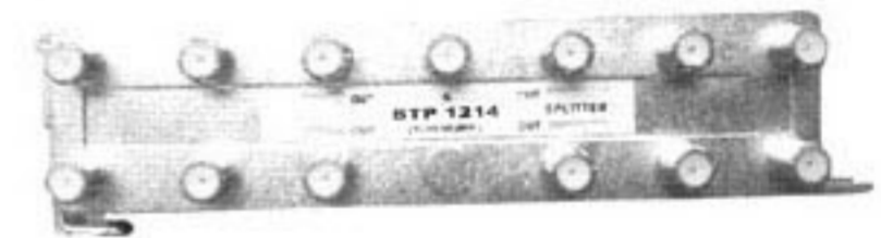
12-Way Splitter Model:STP1214